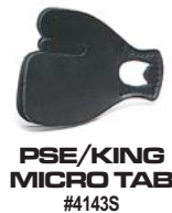
PSE/KING MICRO TAB #4143S