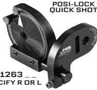
#41263 SPECIFY R OR L