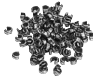
SAUNDERS NOCKING POINTS #2800 $22.99 100 PK