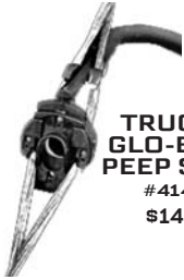
TRUGLO® GLO-BRITE PEEP SIGHT #41440 $14.99