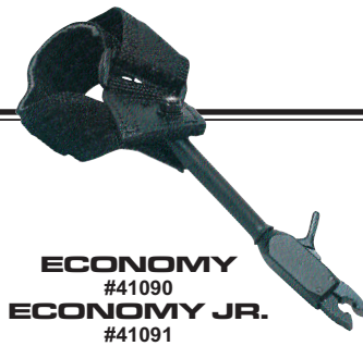
ECONOMY #41090 ECONOMY JR. #41091