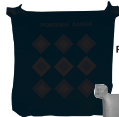
MORRELL™ PORTABLE RANGE TARGET #1758 $35.99